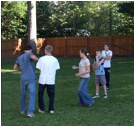
Youth at the Scarboro's home playing foot ball and volley ball.